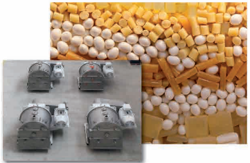
Screen scroll centrifuges for plastic granule extraction