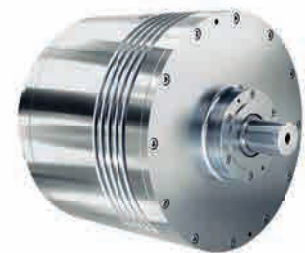
ZP – Planet Line

The highly dynamic centrifuge drive for high drum and differential speeds with a proven flange design and all-steel construction.