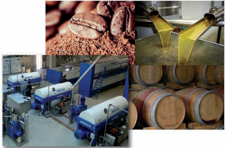
Decanter for olive oil