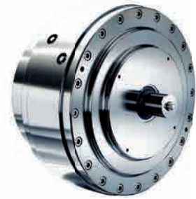
ZS – Cyclo Line