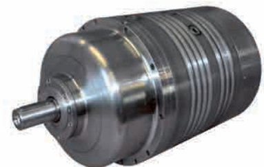
ZP – Planet Line

* ZPN input and output shafts with the same rotation direction