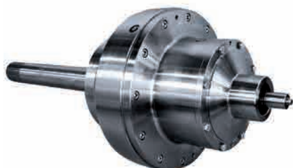
ZSP – Cyclo/Planet Line

ZSPN external drive with customer-specific output for trailing scrolls