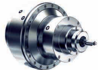
ZSP – Cyclo/Planet Line

The two-stage, high-capacity centrifuge drive for high reduction ratios and differential speeds with a proven flange design and all-steel construction.