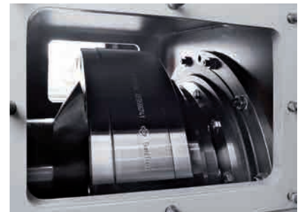
ZS – Cyclo Line